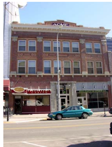
The Acme Building, recently listed in the National Register.

A full compilation of Montana properties listed in the National Register is available through the Society's website: http://montanahistoricalsociety.org/shpo/nationalreg.asp .